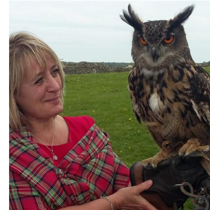
[An Introduction at a wedding ceremony]